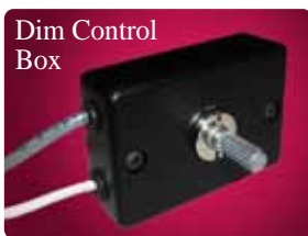
Dim Control Box